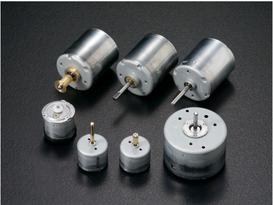
Clockwise from top left: CMC22H(3 units); CMC27H; CMC13H(3 units)